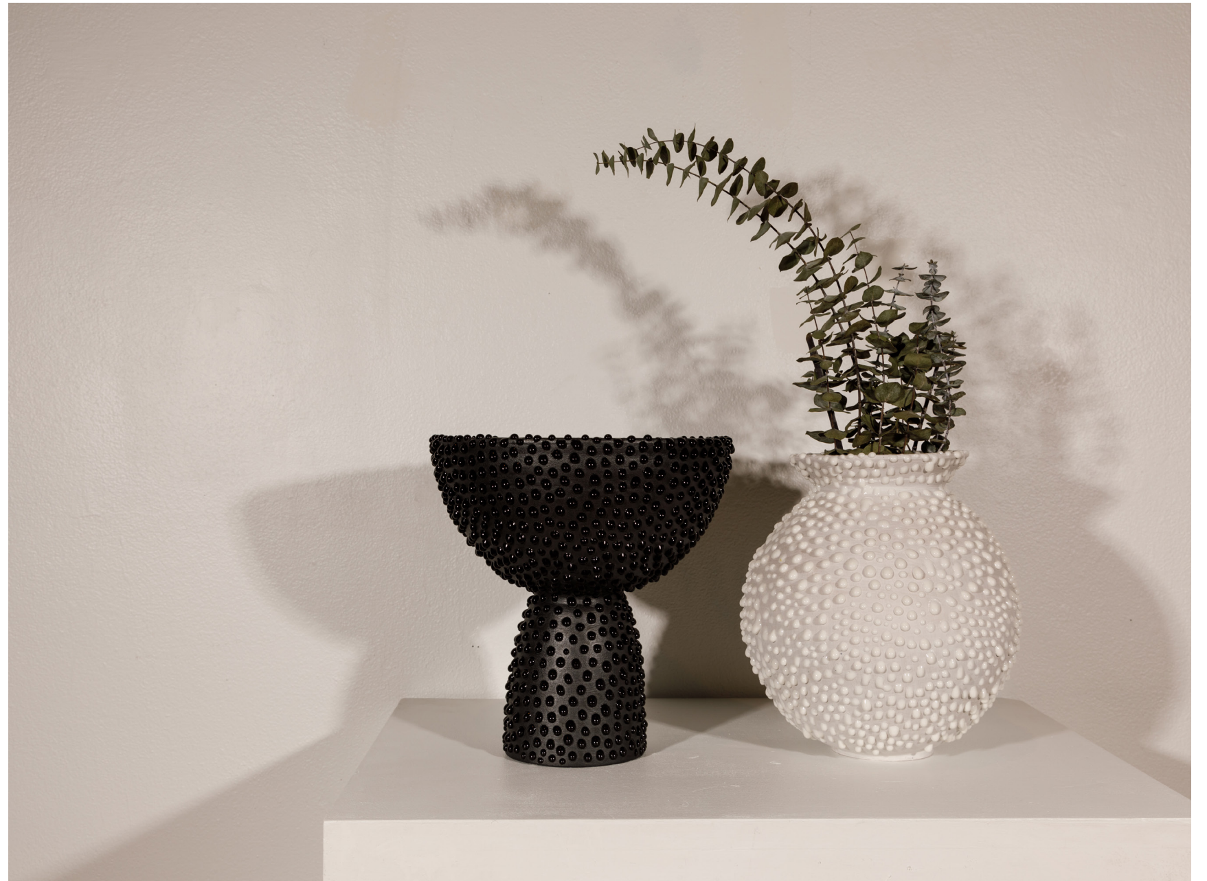
Breathe, Burn , 2024 black pedestal bowl and a white vase with eucalyptus 10" x 6"

Using saturated glazes and simple shapes, my work resembles playfulness and imperfections amidst battles with mental health and women's challenges around the world. I invite viewers to engage with each vessel, feeling the textures of smooth protrusions over a rough, raw clay body; I understand that some may find this soothing and some, nauseating, just as it is being a woman facing the modern world. In some of my practice, I allow the glazes to intertwine, or play together on their own while other times working to keep things uniform to represent the range of mental obstacles that the average person may go through on a day-to-day basis, which in the end, evokes resilience, creating the idea that surprise and struggle is in the process to success. My art is a reminder that there is appeal and self-discovery beyond these affairs.