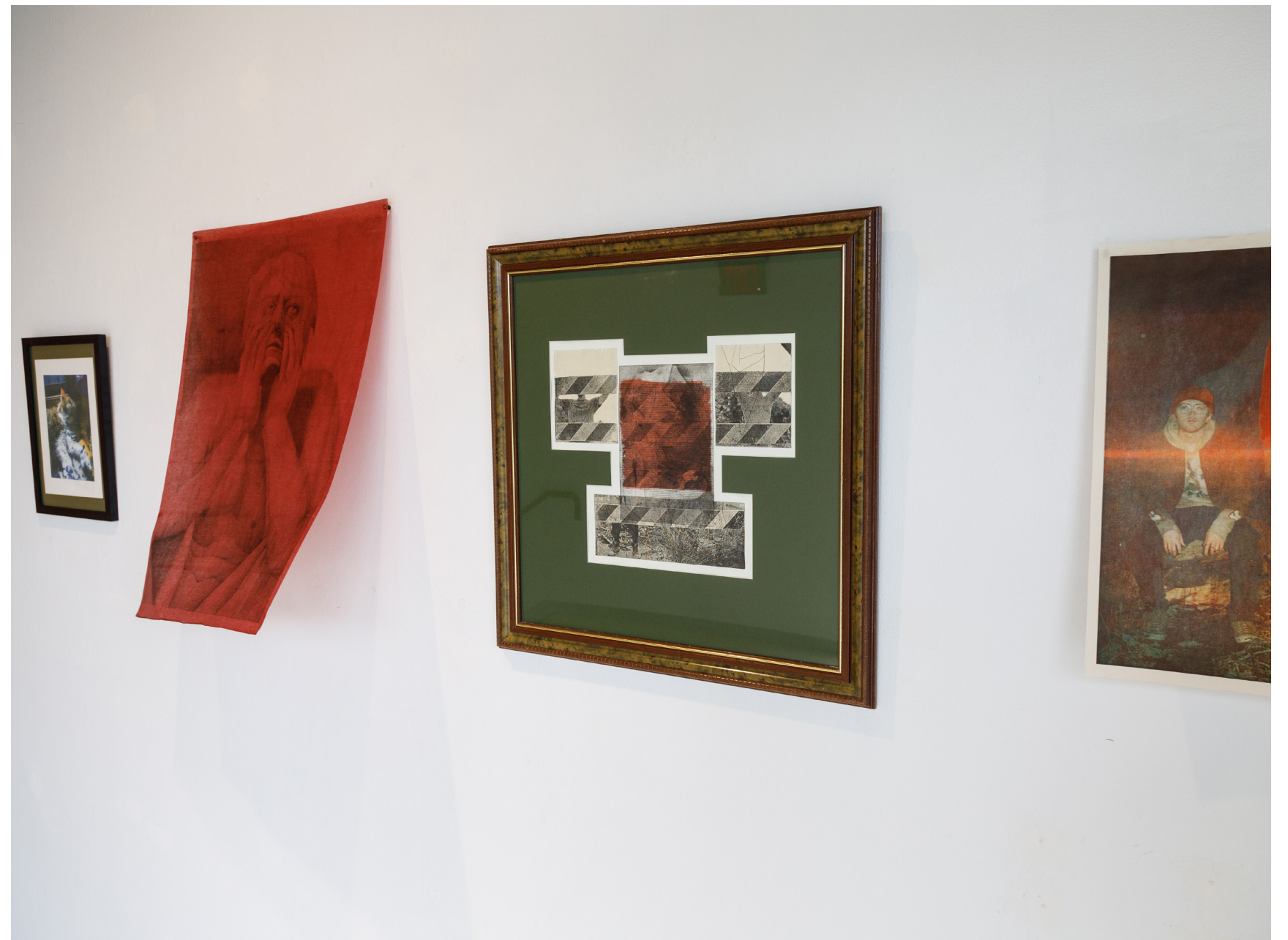
Grief , 2024 lithography 24" x 32"